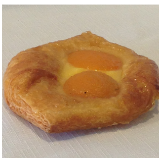
Open Apricot Danish

Moist sweet muffin packed with apple and berries