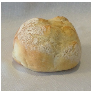
White Organic Round Roll