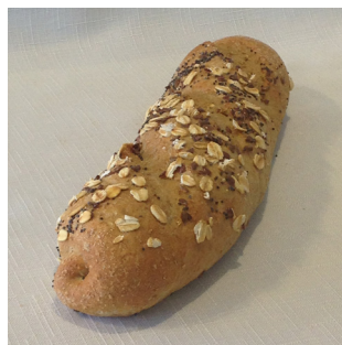
Wholemeal Seeded Long Roll roll