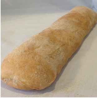
Ciabatta Loaf Organic 0530 Denser style than traditional, organic flour