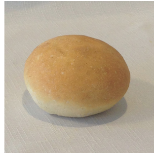
Burger Bun Mini Organic 0821 Perfect for sliders