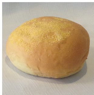
English Breakfast Muffin Organic