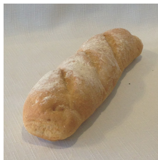
Sourdough Organic Roll Long