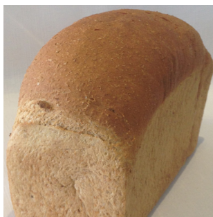
Wholemeal Organic 0120 Organic wholemeal