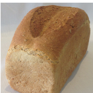
Multigrain Organic 0330 Lighter style multi grain