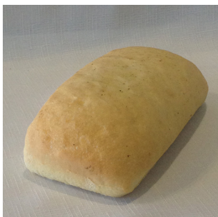
Tasty Panini Roll