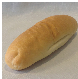
Hot Dog Roll