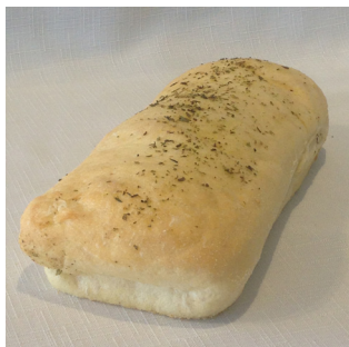
Tasty Foccacia Roll with Herbs

Dressed with oat flake, poppy and linseed