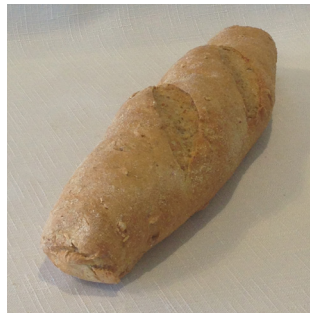
Multigrain Long Roll