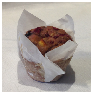
Wildberry & Apple Muffin