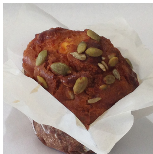
Apple Cinnamon Muffin