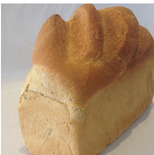
Panini Organic 0030 Organic white with malt