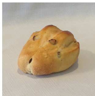
Polenta & Sultana Roll