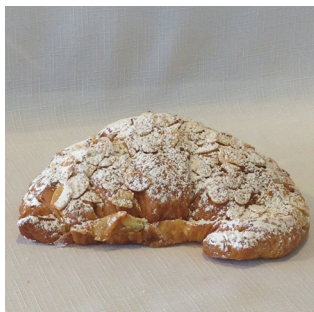
Almond Croissant 4065