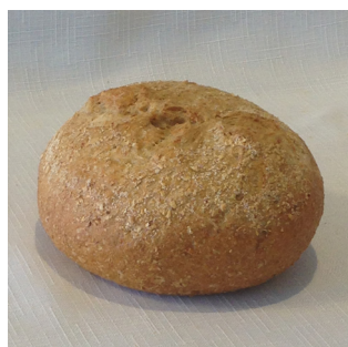
Wholemeal Organic Round Roll