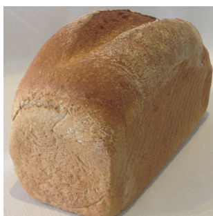
Rye Wholemeal Sandwich 0410 Blend of rye and wheat