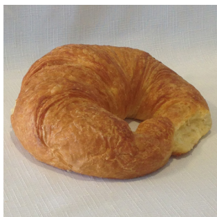
Butter Croissant 4000