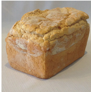
Rice Soy & Buckwheat 2900 Gluten Free by ingredient Soft textured bread