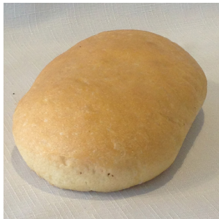
LC Tasty Roll