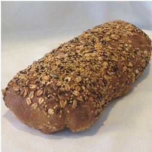
Rustic Ciabatta Seeded Wholemeal 0533 Famous Swiss style wholemeal