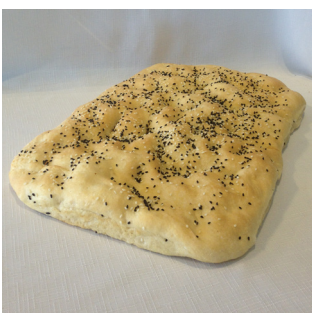
Turkish Flatbread Organic 0640

Approx 40cm x 68cm, sprinkled with herbs