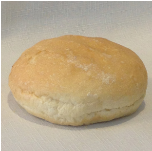
Burger Bun Organic 0760 Organic white flour