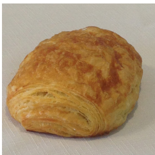
Chocolate Croissant 4030