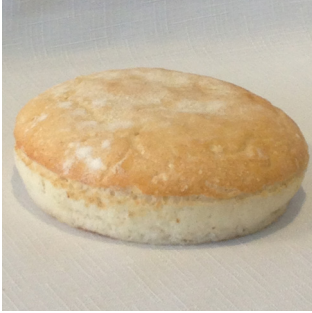
Gluten Free Roll Round bag of three 2910 Gluten Free by ingredient