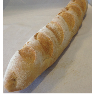
Sourdough Baguette Organic 0380 Crunchy yeasted sourdough