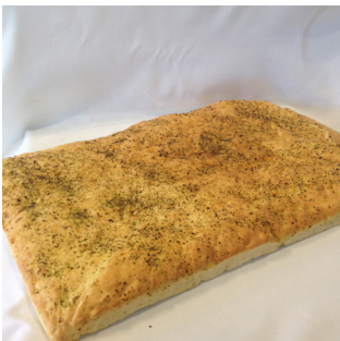
Foccacia Slab 0690

Approx 40cm x 68cm, sprinkled with herbs