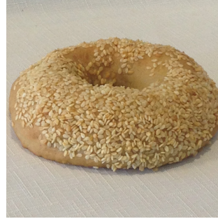
Organic Sesame Bagel bag of four 1025 Organic white flour