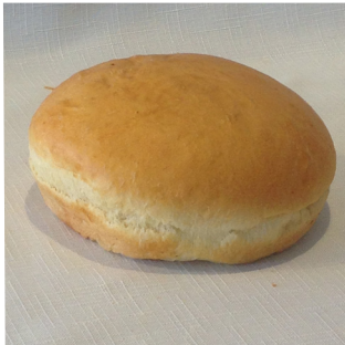
Brioche Burger Bun 1001